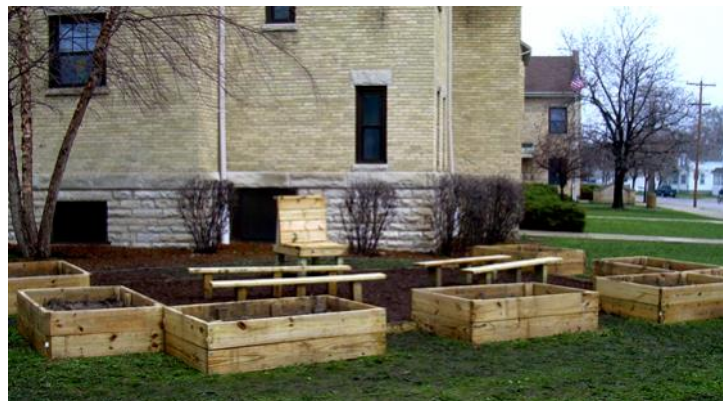
The outdoor classroom on the southwest corner of Frank Elementary school. This gives the children the opportunity to put to use some of what they learned in their year in their forestry classes.